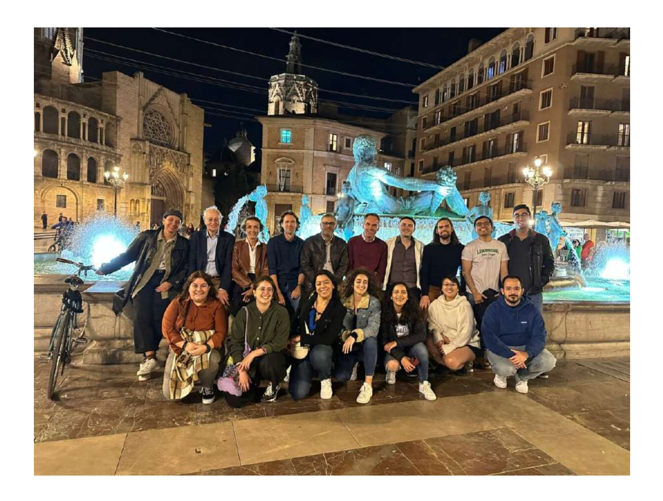
Enjoying a night in the city center of Valencia after a fruitful meeting

Last PersonalizeAF meeting in Valencia, 23rd and 24th of October 2023